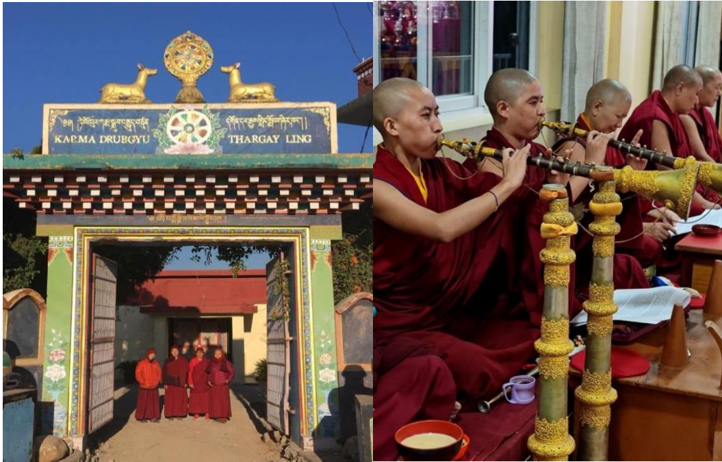
These photos show the entrance to Tilokpur Nunnery, the nuns performing sacred rituals with various instruments and below sacred texts used in teachings.